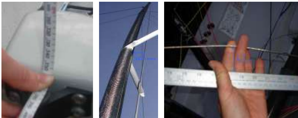
Figures measuring from left to right rake, pre-bend and lowers deflection.

Again a lot of variation but the majority of people were using 40-50 mm. The extremes ranged from 90mm to 10mm, both of whom interestingly finished in the top 5.